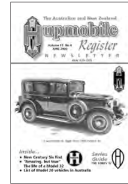
Vol 11 No 4 June 2000

Features: Basic Panel Repairs Series 'K' on the Road The R.C.H. Story continues. Oil for Hupmobiles NZ Records 1923-30 Chandler Corner