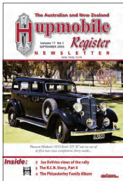
Vol 17 No 1 September 2005

Features: 12th Australian & NZ Hupmobile Tour, Phillip Island Victoria Making Mudguards Model R Maintenance Tasmanian Hupmobiles Chandler Corner