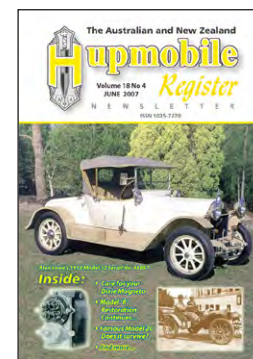
Vol 18 No 4 June 2007

Features: Hupp locking door handle Part 6 Model 'R' Restoration Badger's Century Six 1933 Series 'K' progress Model R Maintenance Chandler Corner