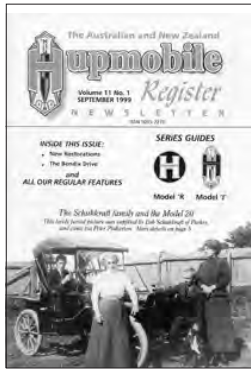
Vol 11 No 1 September 1999

Features: 9th Australian National Rally Issue NZ Records 1923-30 Chandler Corner