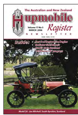
Vol 17 No 3 March 2006

Features: On the Road with the 6-cylinder Hupp Wire Wheels Model 'R' featured in Major Film Phizackerley Family Album - Pt. 2. Model R Maintenance Tasmanian Hupmobiles Chandler Corner