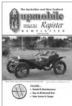
Vol 12 No 2 December 2000

Hupmobile Water Pumps NZ Records 1923-30 Chandler Corner Robert Craig Hupp The Hupmobile Straight Eight Eights on the Road