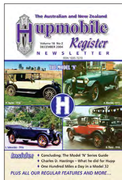
Vol 16 No 2 December 2004

Features: R-C-H Body Styles and all known owners Hupmobile Taxi-cab Lamp Repairs Hupmobile Six - 1926 Model R Maintenance Tasmanian Hupmobiles Chandler Corner