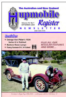
Vol 16 No 1 September 2004