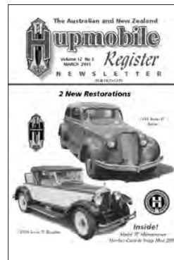
Vol 12 No 3 March 2001

Model R Maintenance Its Good to be Cool Model 20 Back on the Road Chandler Corner A Much Travelled Model R Rare Series K Coupe NZ Records 1923-30