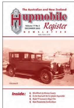
Vol 17 No 2 December 2005

Features: 1933 Series 321K Restoration completed Hupmobile Spark Plugs R.C.H. story - Pt. 4 Phizackerley Family Album - Pt. 1 Model R Maintenance Tasmanian Hupmobiles Chandler Corner