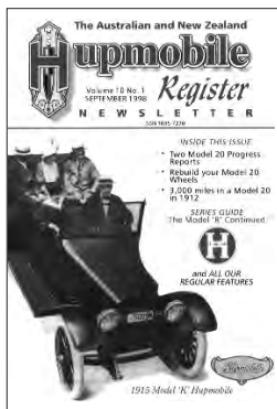
Vol 10 No 1 September 1998