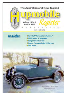
Vol 18 No 3 March 2007

Features: 13th Australian and New Zealand Hupmobile Tour, Devonport, Tasmania Your Vacuum Tank Bay to Birdwood Run Part 5 Model 'R' restoration Model R Maintenance Chandler Corner