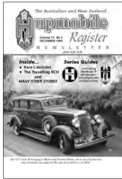
Vol 11 No 2 December 1999

Features: The Bendix Drive Model N Find Century Six Find 1934-327T Restoration New Restoration 1923 Model R NZ Records 1923-30 Chandler Corner