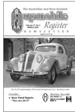
Vol 11 No 3 March 2000

Features: The Travelling RCH Rare Cabriolet Feature Restoration of a 1927 Series 'A' Series 'O' Progress NZ Records 1923-30 Chandler Corner