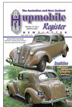
Vol 16 No 3 March 2005

Features: 100 miles in a Day in a Hupmobile Charles D Hastings - what he did for Hupp Model R Maintenance Tasmanian Hupmobiles Chandler Corner