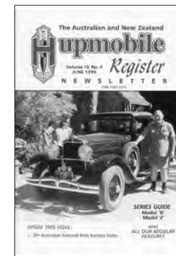
Vol 10 No 4 June 1999

Features: Motoring around the world in a Model 20 The Rescue and restoration of a Model 32 A Series 'K' hits the Road NZ Records 1923-30 Chandler Corner