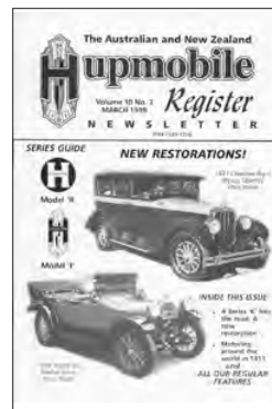
Vol 10 No 3 March 1999

Features: The Hupmobile Six 1930 - S Roadster NZ Records 1923-30 Bay to Birdwood Run Gympie Rally Chandler Corner