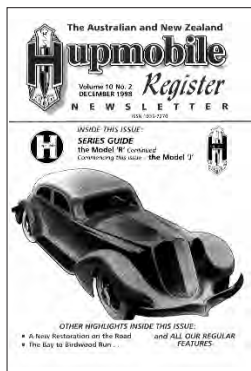
Vol 10 No 2 December 1998

Features: The Hupmobile Six Backyard Wheelwright 1910 Model 20 NZ Records 1923-30 A Big Trip with a Little Car - 1912 Chandler Corner