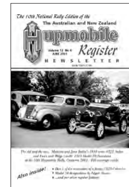
Vol 12 No 4 June 2001

Model R Maintenance Fitting an Overdrive Gearbox NZ Records 1923-30 Chandler Corner The Rebirth of a Hupmobile 1926 E Roadster Restoration Completed 1935 Series O