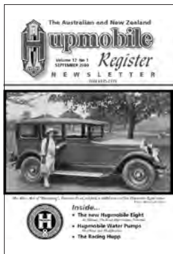
Vol 12 No 1 September 2000

Features: Interchangeable Wheels and Rims Century 6 Restoration Completed List of Model 20 Hupmobiles in Australia The Life of a Model 32 NZ Records 1923-30 Chandler Corner