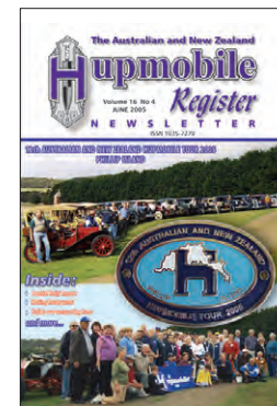
Vol 16 No 4 June 2005

Features: Making a Windscreen Frame Rare Model B Find Series 'G' Model R Maintenance Tasmanian Hupmobiles Chandler Corner