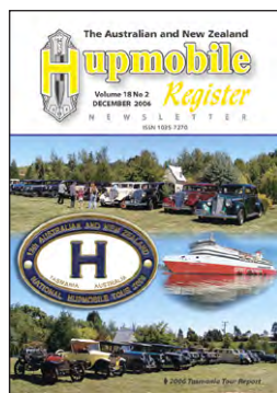
Vol 18 No 2 December 2006

Features: Oils for a Classic Car Part 4 Model 'R' restoration A Rare Coupe emerges Ron Bailey's photos from the past Model R Maintenance Chandler Corner